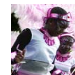
Culture & Tourism