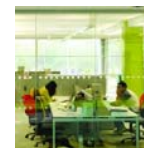
Skills and employability