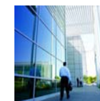
Enterprise and innovation