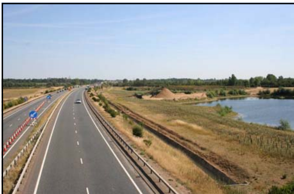
Bedford River Valley Park