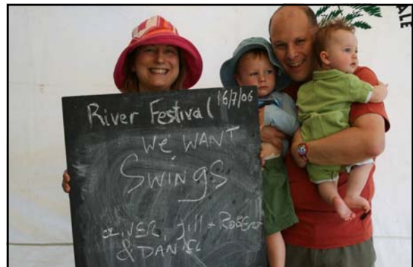
Bedford River Valley Park